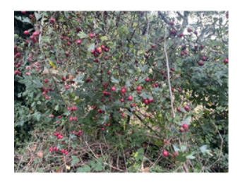
Above: Native Dogrose (Rosa Cania)

The maintenance jobs include keeping the path and verge clear for pedestrian access; snipping back and weeding-out the dominant species such as sloe saplings and brambles which, left unmanaged, would prevent other plants developing and unbalance the area to its detriment. Volunteers will receive expert support and guidance from professional conservation and wildlife Garden Consultant, Angela Palmerton of Natural Gardens.